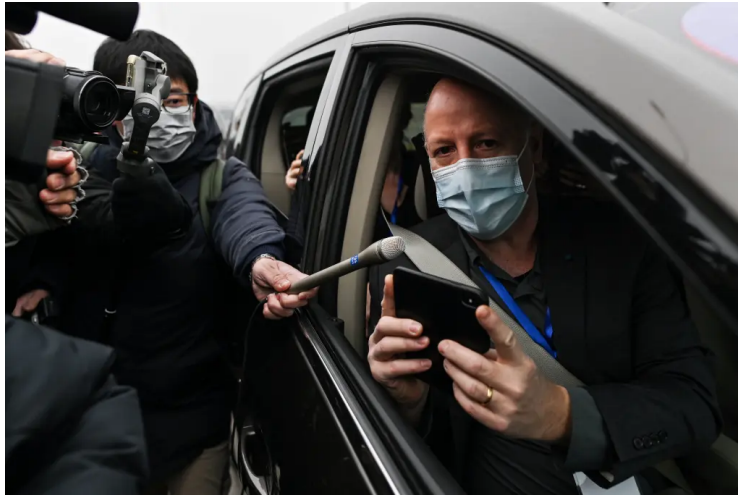
The families of four people who died of coronavirus sued Peter Daszak and EcoHealth Alliance on Aug. 2 in Manhattan Supreme Court.