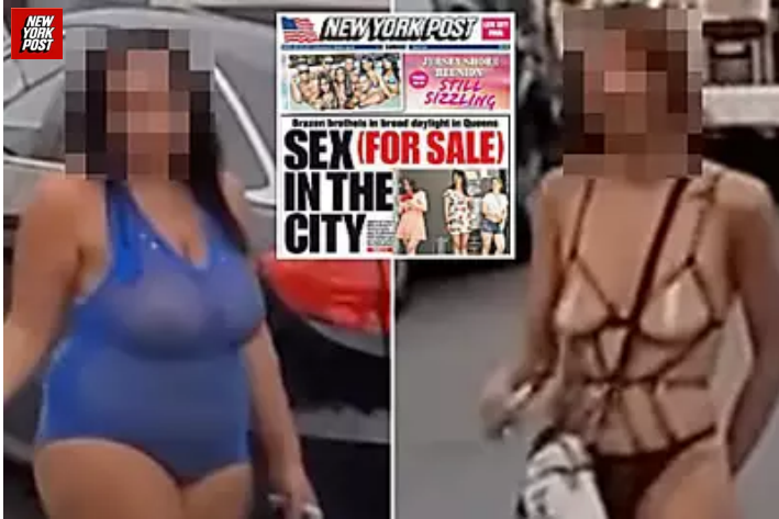
Video shows open-air prostitution in yet another NYC neighborhood as hookers stroll in broad daylight