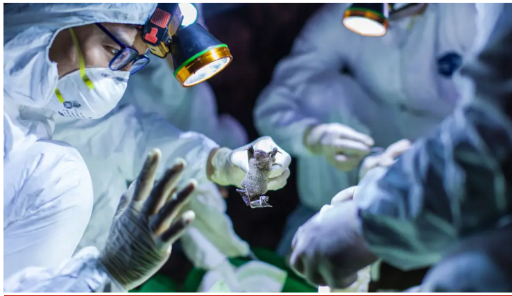
The victims' families claim EcoHealth attempted to cover up the origin of the virus.