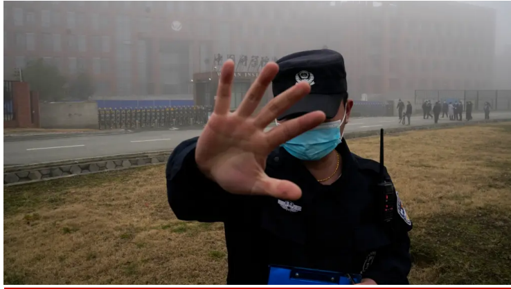
The families of four people who died of COVID have sued EcoHealth Alliance, which funding bat coronavirus research in Wuhan, and its president.