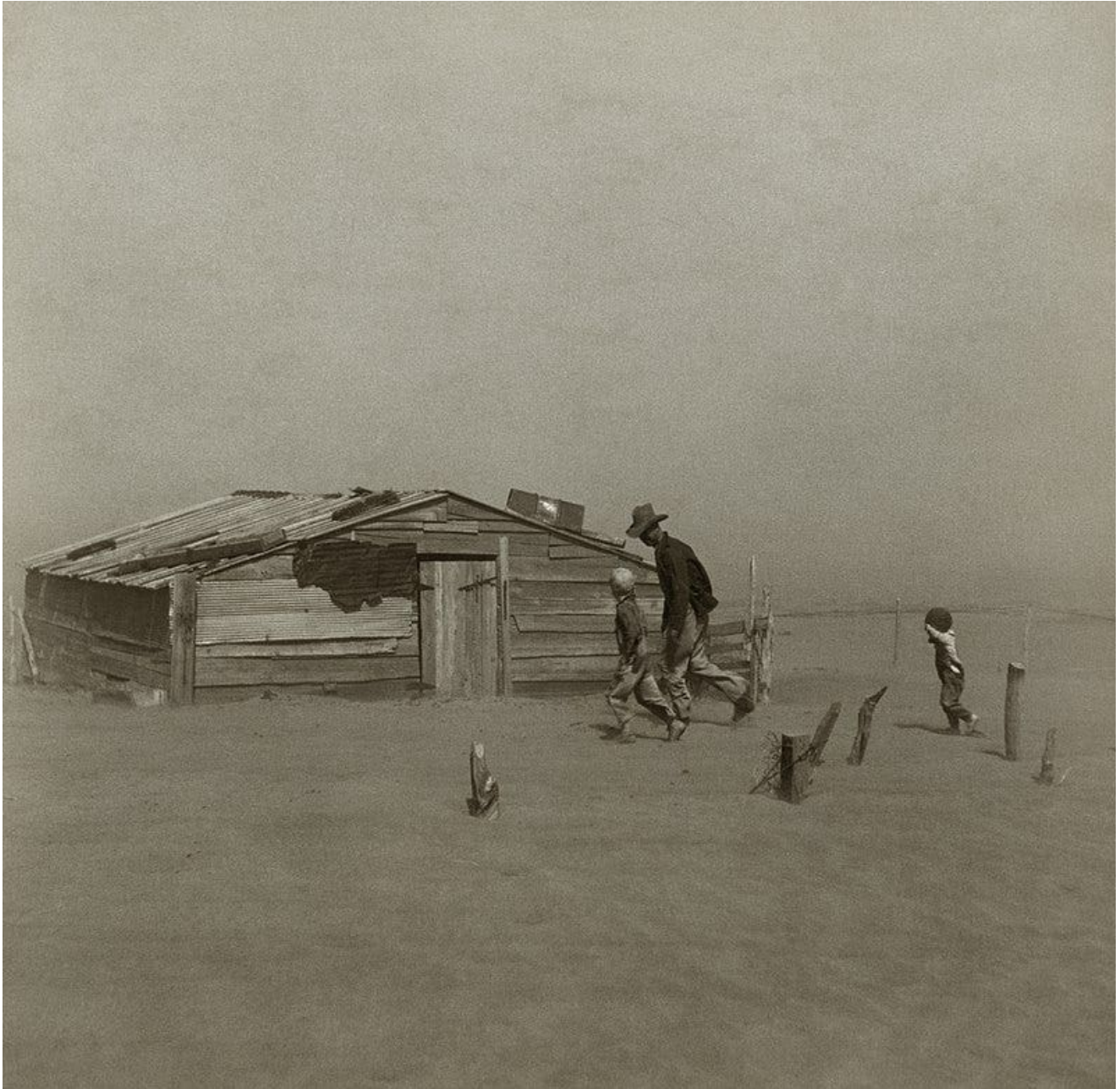
A farmer and his two sons during a dust storm in Cimarron County, Oklahoma, April 1936. Iconic photo entitled "Dust Bowl Cimarron County, Oklahoma".

When you observe the puzzling behavior of those leading the scare campaign about CO 2 emissions, it's strange to see them allowing forest fires to ignite and spread unchecked. It makes you question their intentions, considering we've always been told that carbon dioxide is harmful. So why are they contributing to increased CO 2 levels by allowing trees, which absorb carbon, to be destroyed?