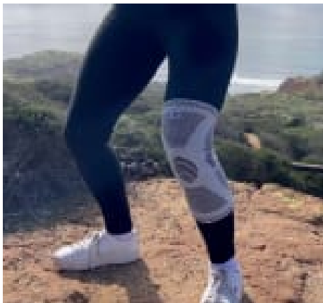
Want Youthful Knees Again? These "Bionic" Knee Sleeves Will Transform Your Knees