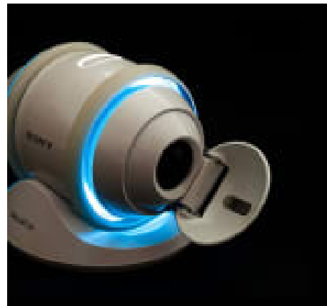
Here Are 23+ Hottest Gifts of 2023