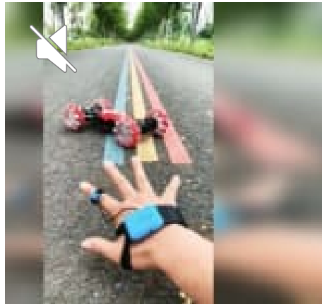
Is This Gesture Remote Control Car Suitable As a Birthday Gift?