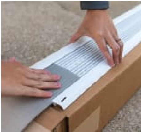
Gutter Guards for One-story House: How Much Would It Cost?