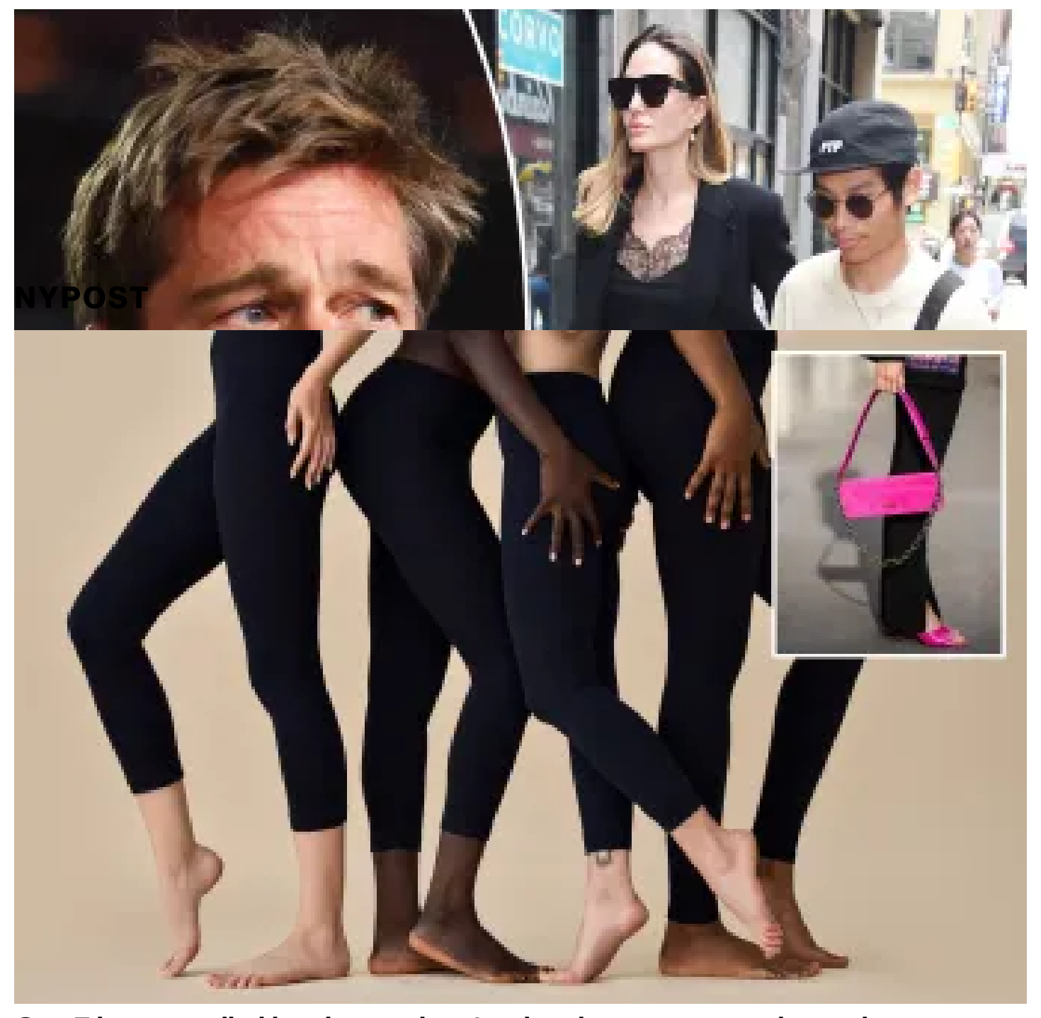
Gen Z has cancelled leggings — here's what they say to wear instead