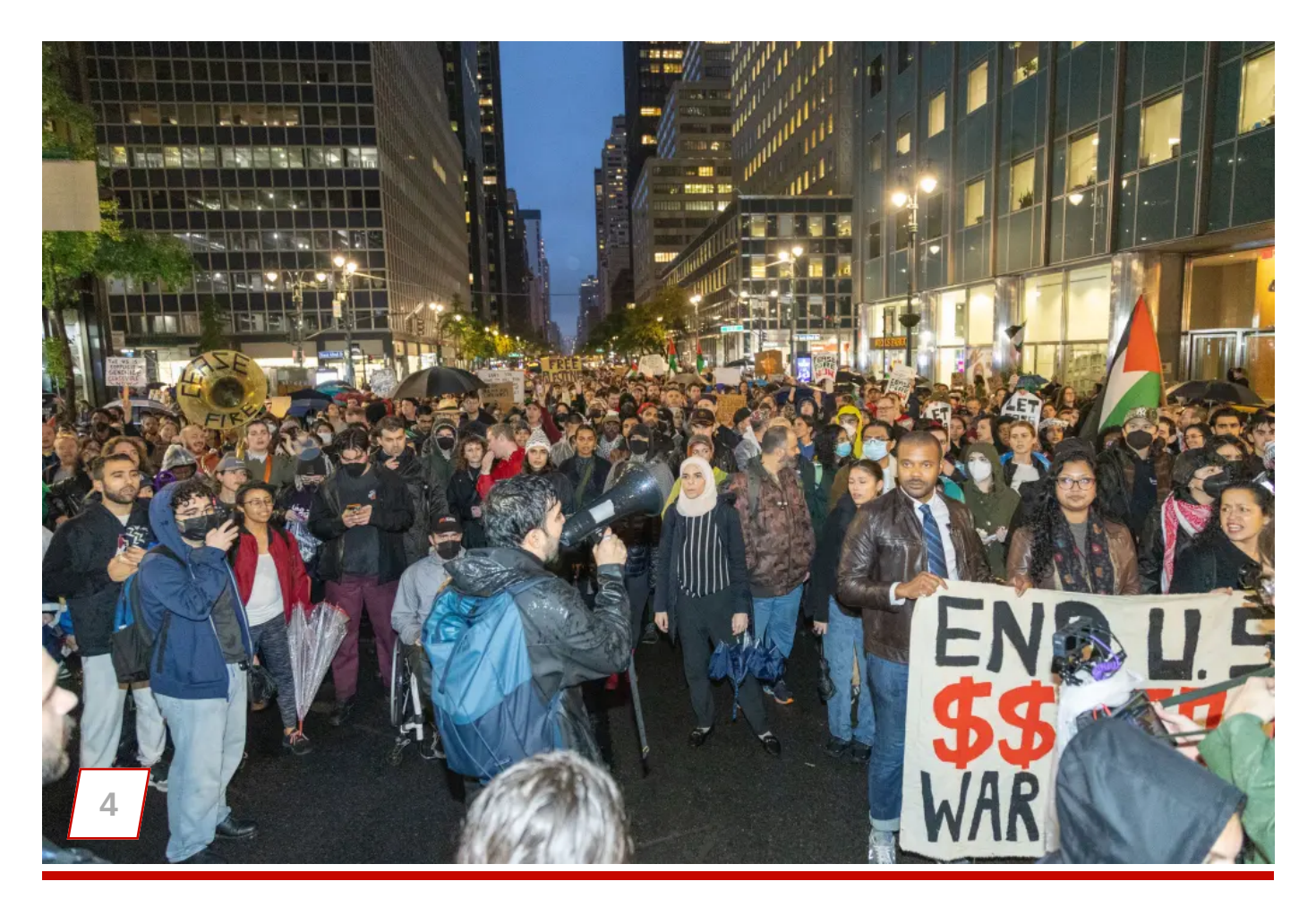
Many groups that received Soros grants sponsored an Oct. 20 protest in Manhattan, where demonstrators spewed antisemitic chants.

Open Society Foundations also awarded $1.5 million to Adalah's founding nonprofit, Adalah – The Legal Center for Arab Minority Rights in Israel, but only $800,000 of it was received before the legal center cut ties with the American organization in 2018. The legal center says its mission is to promote human rights in Israel.