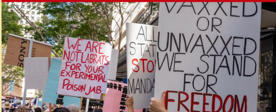
France: "Article Pfizer" criminalising criticism of mRNA injections passed by National Assembly