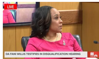
Fulton County DA Fani Willis Testimony Suddenly Halted