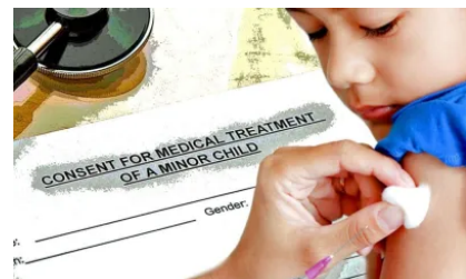
Why the Proposed “Minor Consent” Law in New York Must Be Defeated