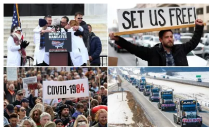
The Covid Resistance Deserves the Nobel Peace Prize