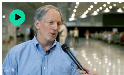
Data Analyst Unveils Alarming Post-Vaccine Cancer Statistics