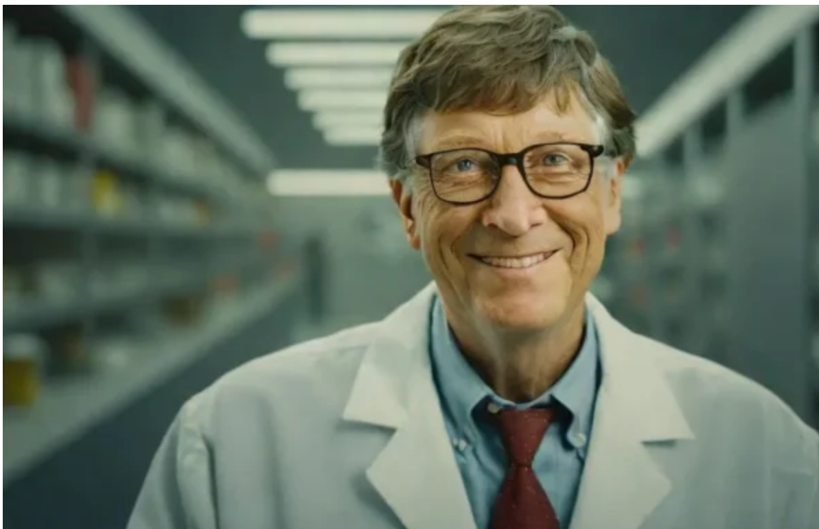
AI generated image.