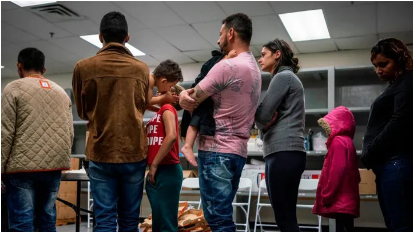
Migrant children wait to receive food at The House of Refuge in El Paso, Texas, on April 24, 2019.