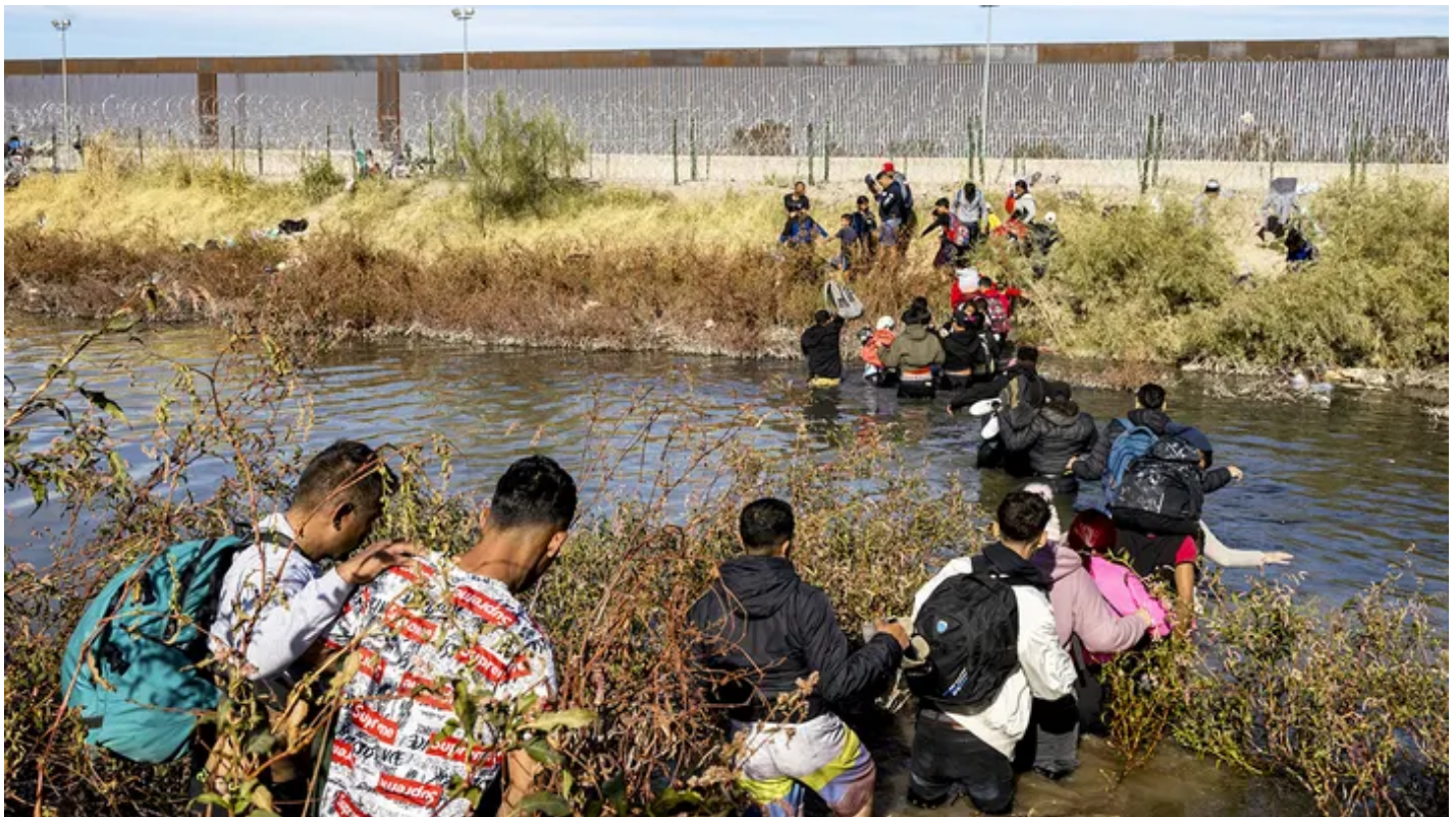
Hundreds of migrants, predominantly from Venezuela, cross the Rio Grande.

"This is no different from the work of schools who enroll migrant children, the clinics and hospitals who care for the needs of their ill, the churches, synagogues, and mosques who welcome their families to join in worship," a spokesperson told Fox News Digital. "For the Attorney General to suddenly attack Annunciation House after forty-six years of service to the poor is simply shameful."