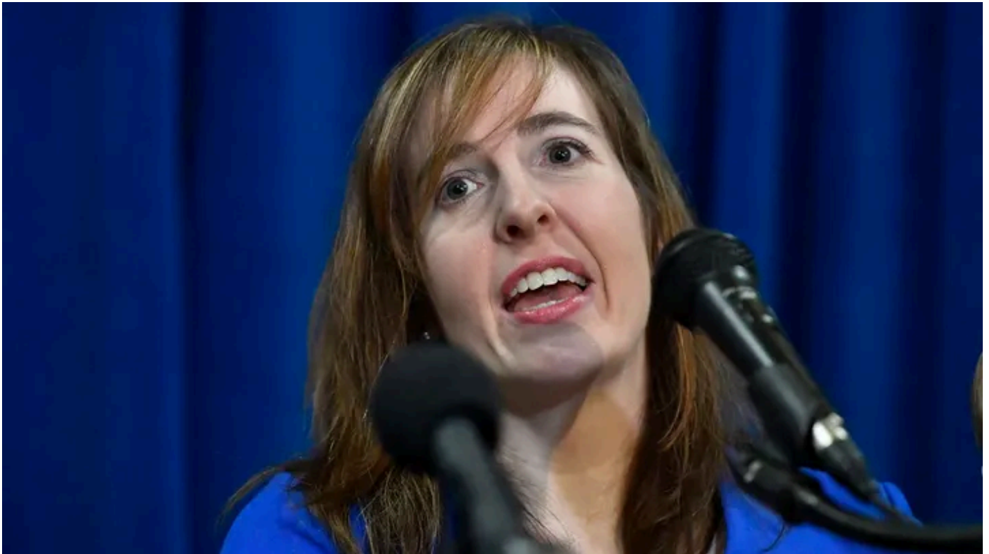
Kentucky State Auditor Allison Ball

And the letter pointed to Bank of America's low ranking on the Viewpoint Diversity Score Business Index, a benchmark for measuring corporate respect for free speech and freedom of religion. The index found that Bank of America partners with left-wing groups like the Human Rights Campaign and the Center for American Progress when it comes to its gift-matching program but leaves out faith-based groups, instead citing its support for "homeless shelters, soup kitchens or other social service needs."