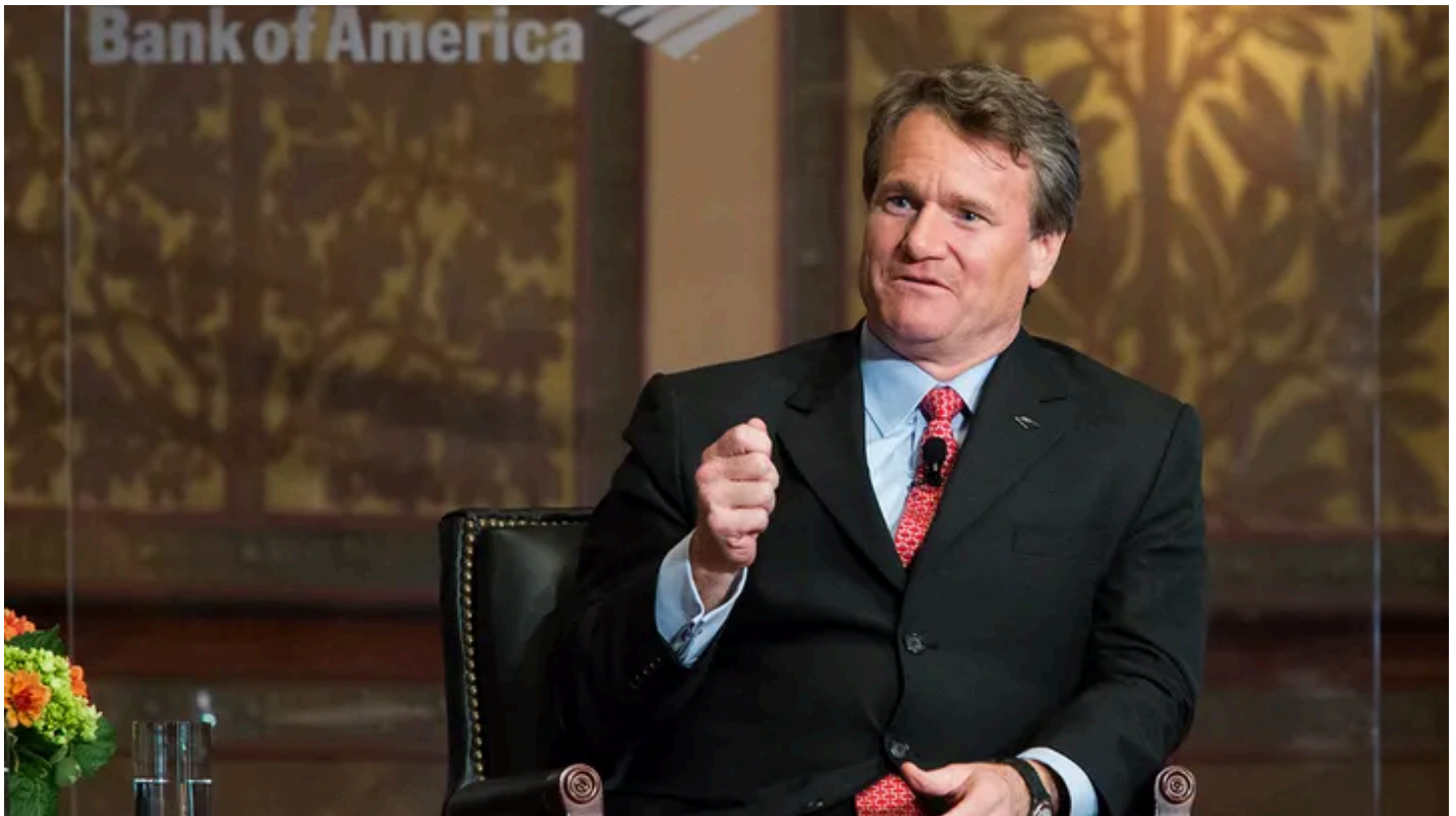
Bank of America CEO Brian Moynihan