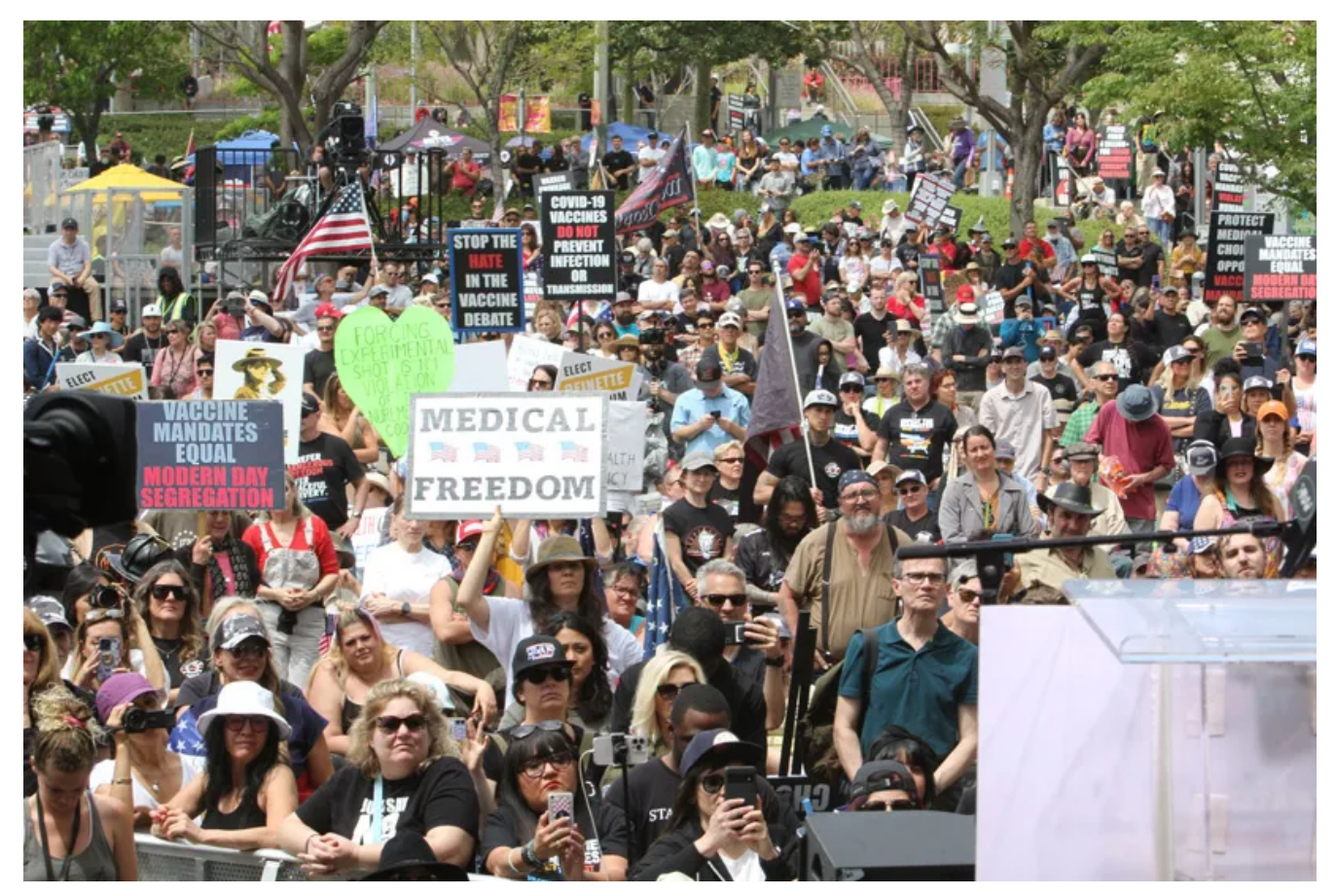
Behold! Some Americans pushed back on college vaccine mandates. They had the best signs and the truth on their side.

For all my Covid writing, I probably don't do enough to publicize the heroes of our freedom movement or the victories "our side" has achieved.